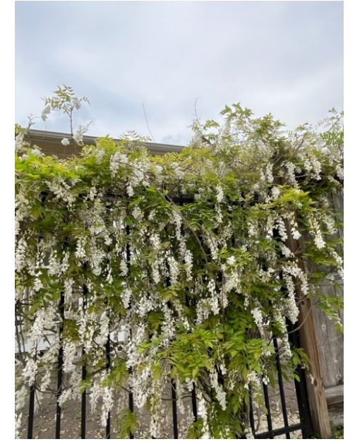
East Montrose Civic Association Newsletter